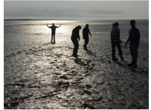
Opening minds: Brymore English Focus Day...

We pride ourselves on our record of 'outstanding' teaching (noted again by Ofsted in 2018) which encourages boys to exceed expectations and achieve the best possible results (currently top in Somerset). We encourage our students to think for themselves, to analyse language with originality and perception, to develop into confident, highly skilled critics. There are no barriers. Boys are expected to work hard and commit totally to all aspects of the course. In return, we aim to inspire, encourage and praise, because enjoyment breeds motivation, which in turn, breeds success.